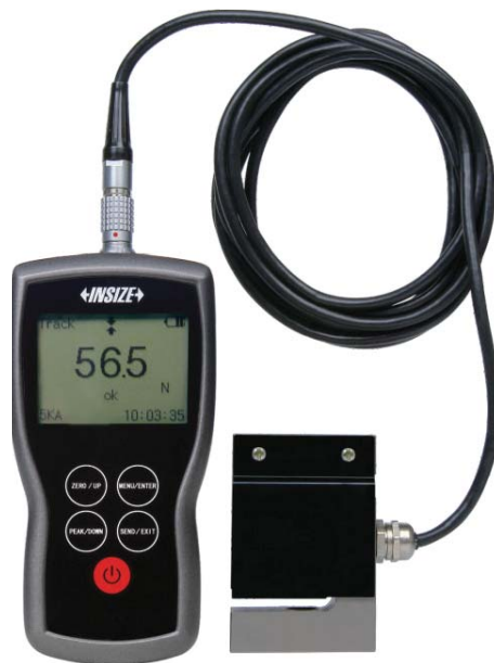
ISF-DF5KA type B