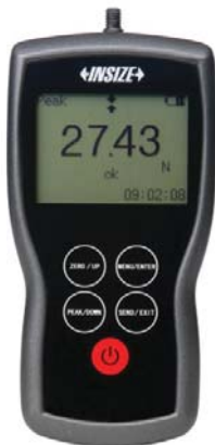
ISF-DF100A type A