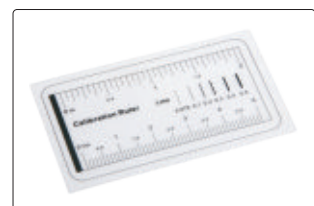
calibration rule (graduation 1mm)