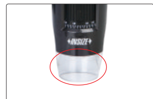
the height of ring is the focus distance