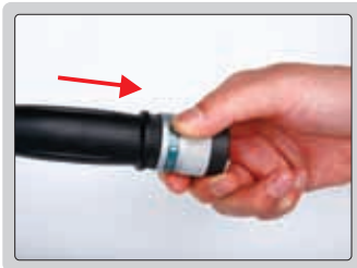
step 1: unlock