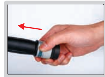
step 3: lock