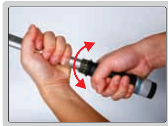
step 2: set