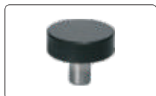
Ø60mm flat anvil