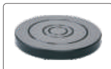
Ø150mm flat anvil