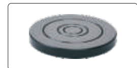
Ø150mm flat anvil