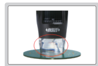
focus supporting ring